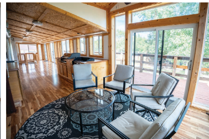
All Season Room