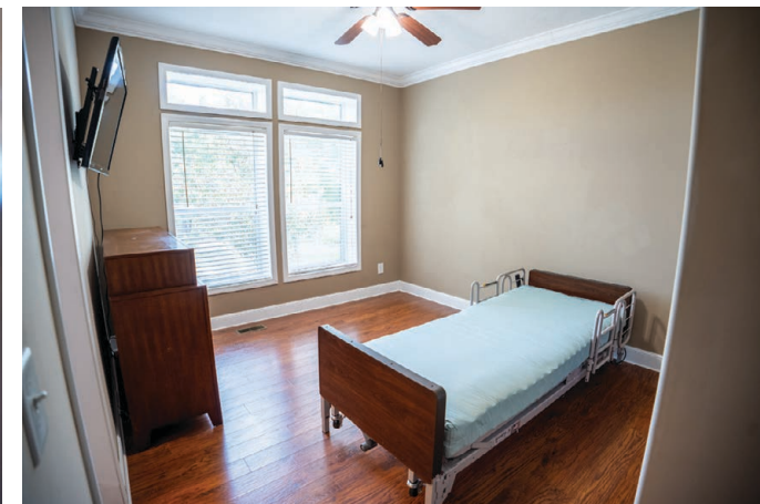
Bedroom 3 w/ attached bathroom