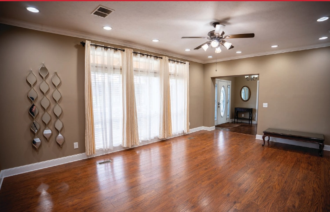
Entry and Sitting Room

Bidding Ends Tuesday, October 10, 2025 @ 12:00 PM, CT