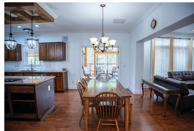
Kitchen with Dining Area