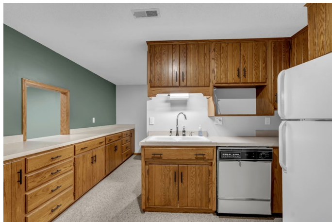
Full Kitchen in Basement