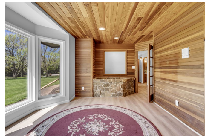
Office / All Season Room