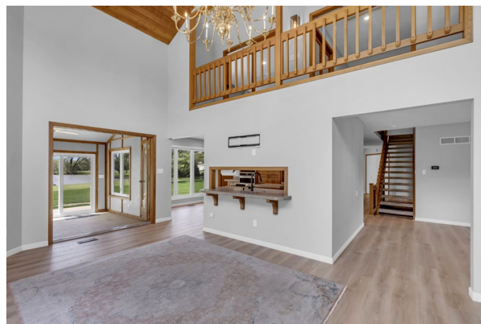
Great Room / Family Room