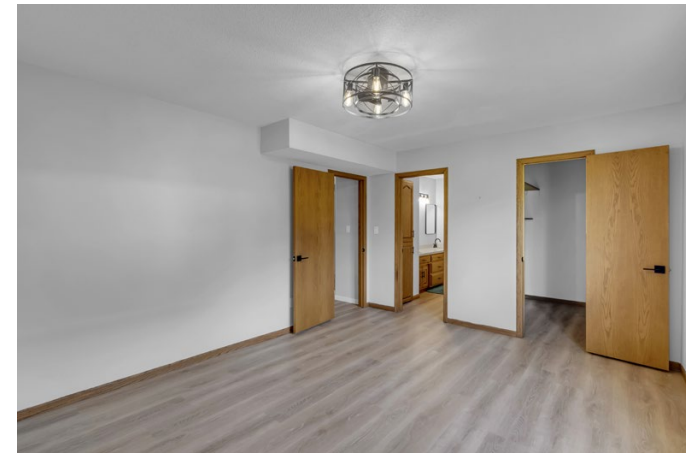
Bedroom 2 with Attached Bath