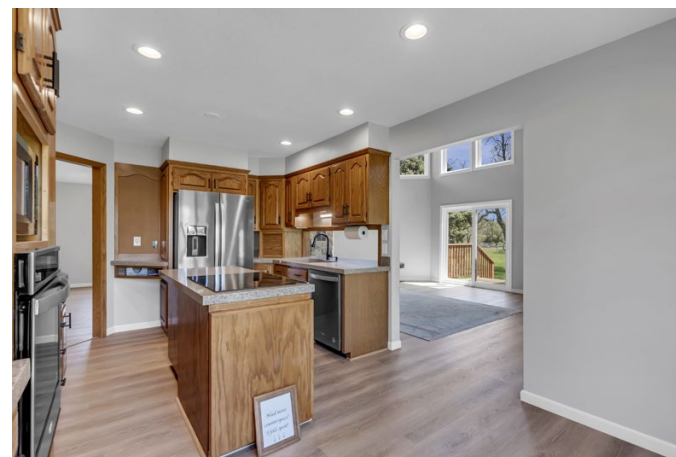
Kitchen with Breakfast Room