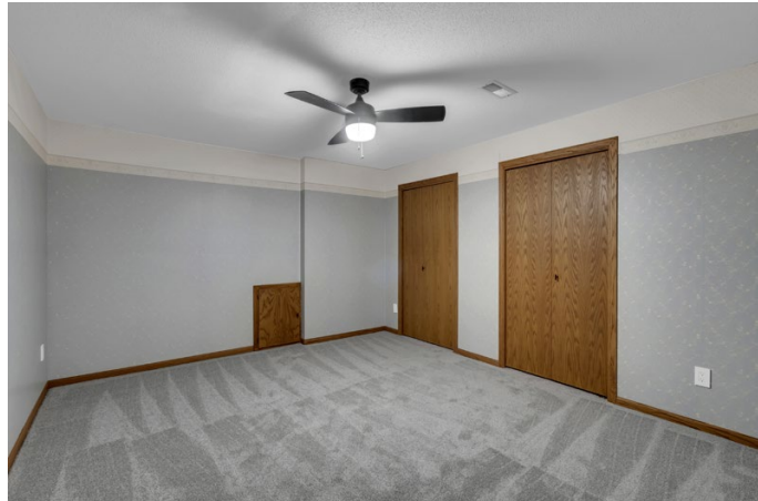
Basement Bonus Room 6