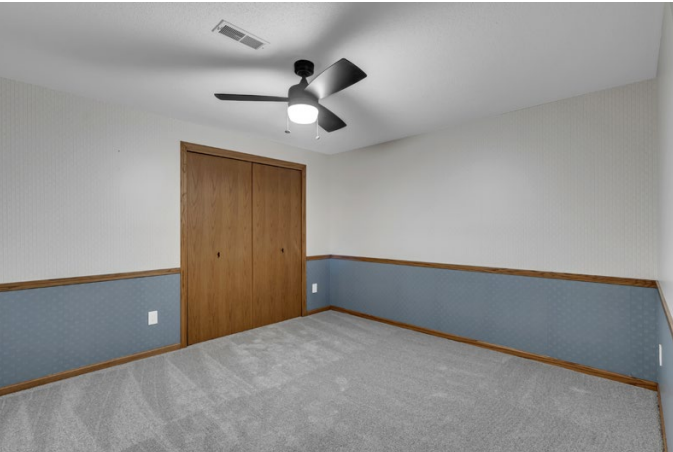
Basement Bonus Room 5