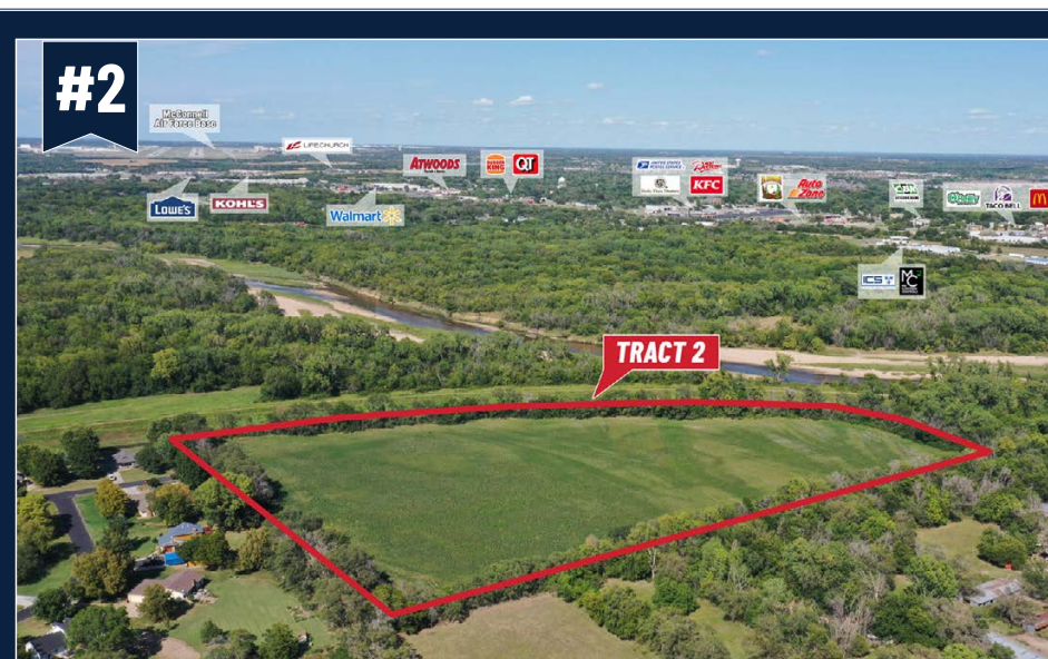
TRACT 2: ACCESS FROM HAVEN DR. Site Size: 18± ACRES