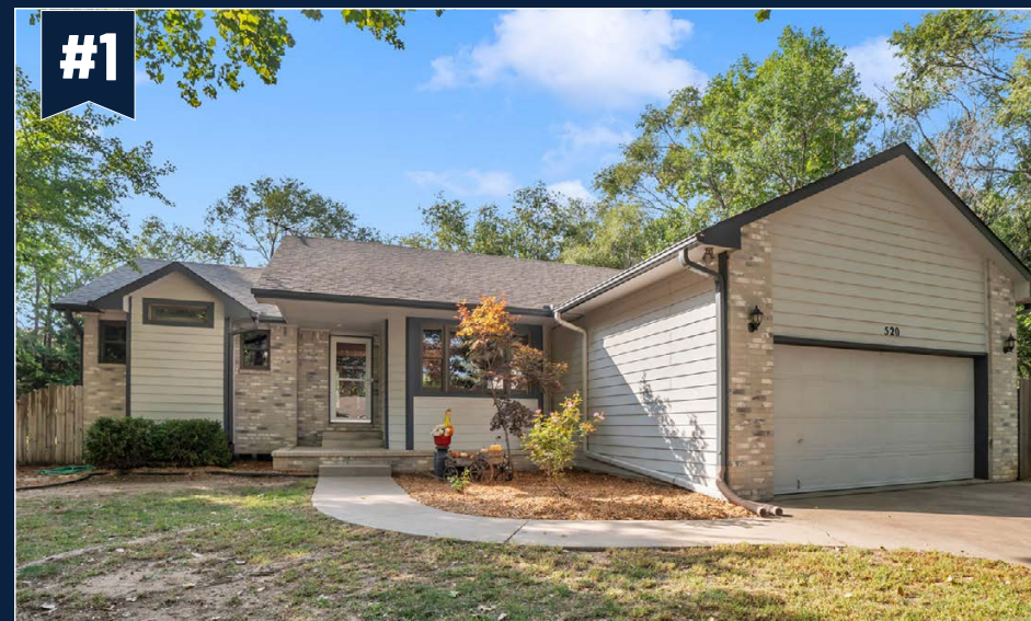
TRACT 1: 520 W. WHITE TAIL ST. Site Size: 64.5± ACRES